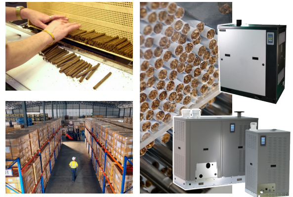
RTS® HUMIDIFIER – RESISTIVE ELECTRIC GTS® HUMIDIFIER – GAS-FIRED