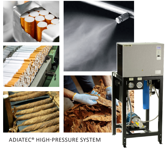
ADIATEC® HIGH-PRESSURE SYSTEM